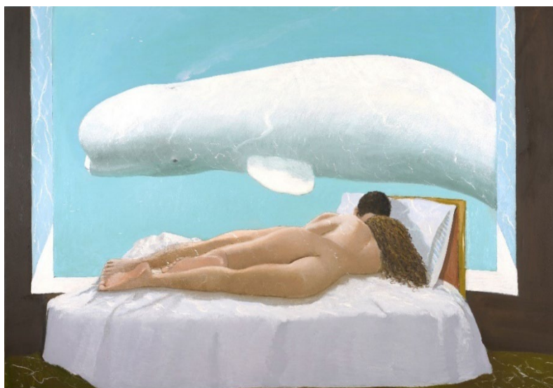
Julio Larraz, Los Amores de Neptuno , 2018, oil on canvas, 146 x 208 cm

Opening in the presence of the artist Wednesday June 11th, 2025 at 6.00 PM June 13rd – October 5th, 2025